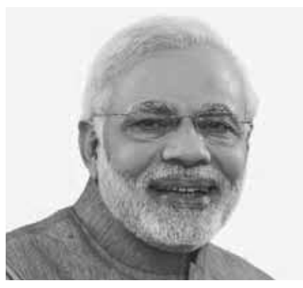
Prime Minister of India Narendra Modi

for the decade. This includes a pollutionfree India; digitization; space exploration; physical and social infrastructure; water management; the "blue economy" (ocean management); self-sufficiency and export of agricultural commodities; enhancing people-to-people partnership; minimum government, maximum governance; a healthy society and well-nourished women and children; safety of citizens; emphasis on micro, small and medium enterprises as well as startups, defense manufacturing, automobiles, electronics, fabrication facilities and batteries; and medical devices under the "Make in India" program. Startup ecosystems and "Skill India" initiatives are playing a significant role in developing India's human resources.